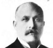
Hover to enlarge

No oil field had ever been as productive as Spindletop. The resulting frenzy became known as the Texas Oil Boom. As a consequence, Texas quickly became one of the biggest oil-producing states in the U.S.