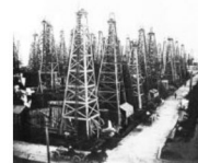
Hover to enlarge

Oil is discovered on January 10, 1901 outside Beaumont, Texas. The first gusher, Spindletop, above left, created an oilfield crowded with rigs, as seen above right in 1903.