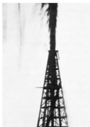
Hover to enlarge

Oil is discovered on January 10, 1901 outside Beaumont, Texas. The first gusher, Spindletop, above left, created an oilfield crowded with rigs, as seen above right in 1903.