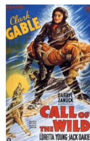
Hover to enlarge

London (shown at top right when writing The Call of the Wild ) wrote many compelling adventure stories which translated well into films, as depicted in the poster advertisements at bottom left (1923) and right (1935).