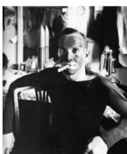
Hover to enlarge

"Big Boy" opens on January 7, 1925 in New York, a unique comedy-musical starring actor-singer Al Jolson (1886-1950), shown here in dressing room wearing traditional blackface (from his minstrel days).