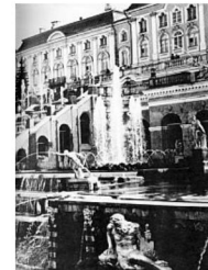
Hover to enlarge

Peter the Great (Pyotr Alexeyevich Romanov; 1672-1725) departs the Netherlands on January 7, 1698 , en route to England on a State Visit. An enlightened monarch, Peter established policies of modernization and expansion that transformed Russia into a world power. He built magnificent structures such as the Peterhof Palace in St. Petersburg, at right, replete with golden statues, fountains, pools, jets and a grand cascade, completed in the year of his death.