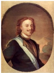
Hover to enlarge

Peter the Great (Pyotr Alexeyevich Romanov; 1672-1725) departs the Netherlands on January 7, 1698 , en route to England on a State Visit. An enlightened monarch, Peter established policies of modernization and expansion that transformed Russia into a world power. He built magnificent structures such as the Peterhof Palace in St. Petersburg, at right, replete with golden statues, fountains, pools, jets and a grand cascade, completed in the year of his death.