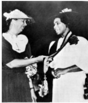
Hover to enlarge

Marian Anderson (1897-1993) became the first black singer to perform at New York's Metropolitan Opera House on January 7, 1955 . The African-American contralto (shown with then-First Lady Eleanor Roosevelt) had been prohibited for years (as were other black singers) from singing at public gatherings made up of whites, until President Franklin D. Roosevelt and wife Eleanor arranged an open-air "Marian Anderson" concert on the steps of the Lincoln Memorial on Easter Sunday, April 9, 1939. More than 75,000 people of all colors attended the event, which was broadcast nationwide and heard by millions.