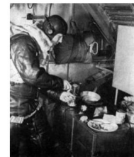
Hover to enlarge

A PYB Catalina crewman cooks a meal while flying on patrol in the Aleutians on January 7, 1942 . The PBV, used as a scout and sea plane during WW II, had a range of 2,530 miles and could stay aloft for more than 12 hours.