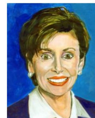
Hover to enlarge

Nancy Pelosi (1940- ), at right, Democratic Congresswoman from the 8th Congressional District of California since 1987, becomes the first female Speaker of the U.S. House of Representatives on January 4, 2007 .