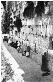
Hover to enlarge

Arabs and Jews battle for control of the Wailing Wall on January 4, 1948 . The Wailing Wall, located in the old city of Jerusalem (also known as The Western Wall) is considered to be the holiest shrine in the city.