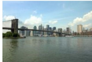
Hover to enlarge

Construction of the Brooklyn Bridge begins on January 3, 1870 , at left towering over a run-down riverside tenement area in 1883 when it opened. The bridge, upon its completion, was the longest suspension bridge in the world (5,989 feet long; 85 feet wide), spanning the East River, and the first steel-wire bridge in the world. The Brooklyn Bridge is shown at right in 2009.