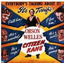
Hover to enlarge