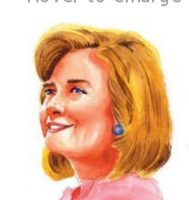
Hover to enlarge

Hillary Clinton (1947- ) becomes U.S. Senator of New York (Democrat) on January 3, 2001 .