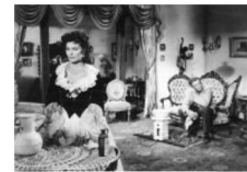
Hover to enlarge

Actress Jean Willes Born April 15, 1923 Died January 3, 1989 Shown with Van Heflin in Count Three and Pray (1955).