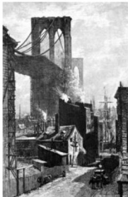
Hover to enlarge

Construction of the Brooklyn Bridge begins on January 3, 1870 , at left towering over a run-down riverside tenement area in 1883 when it opened. The bridge, upon its completion, was the longest suspension bridge in the world (5,989 feet long; 85 feet wide), spanning the East River, and the first steel-wire bridge in the world. The Brooklyn Bridge is shown at right in 2009.