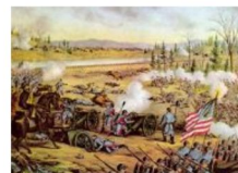
Hover to enlarge