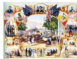
Hover to enlarge

The Emancipation Proclamation was strengthened by the passing of the Fifteenth Amendment to the Constitution, granting rights to all Americans regardless of race, as commemorated in the image at bottom right.