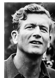
Hover to enlarge

John Lindsey (John Vliet Lindsey; 1921- 2000), Republican politician, became Mayor of New York City on January 1, 1966 , holding that office until December 31, 1973. Lindsey switched parties in 1971, becoming a Democrat. He subsequently made an unsuccessful bid for the Democratic presidential nomination in 1972, and was also unsuccessful as the Democratic nominee for the U.S. Senate in 1980.