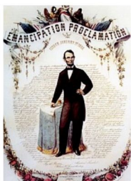
Hover to enlarge

The Emancipation Proclamation was strengthened by the passing of the Fifteenth Amendment to the Constitution, granting rights to all Americans regardless of race, as commemorated in the image at bottom right.